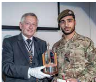
Aland A Community Contribution Award