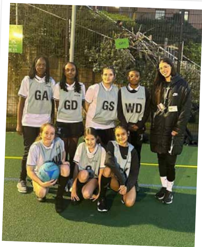
Year 7 Netball Team vs. Elizabeth Garrett Anderson School (away) – 05/12/2023