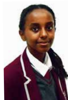
Milka T Outstanding Tutee