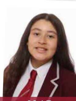
Nai B Outstanding Tutee